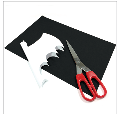
Cut the bat shape out and unfold. This will be your bat template.