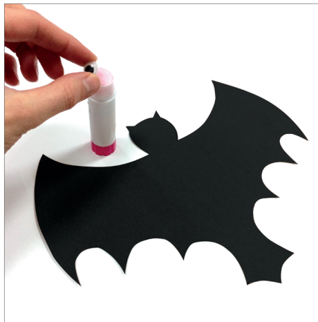
Attached the 2 googly eyes with glue.