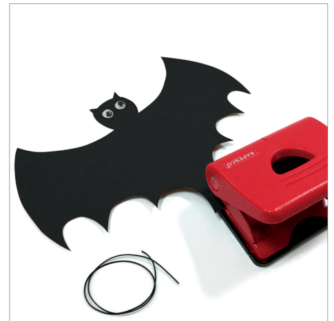
Using the hole punch, punch a hole in the center of the tail at the bottom and attach the cotton. Your bat is ready to hang where ever you wish!