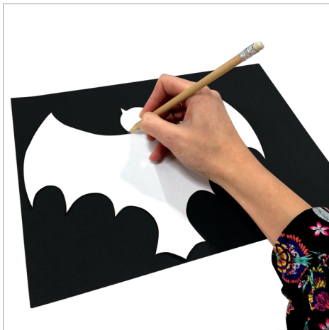
Draw around the bat shape onto the black card and cut out.