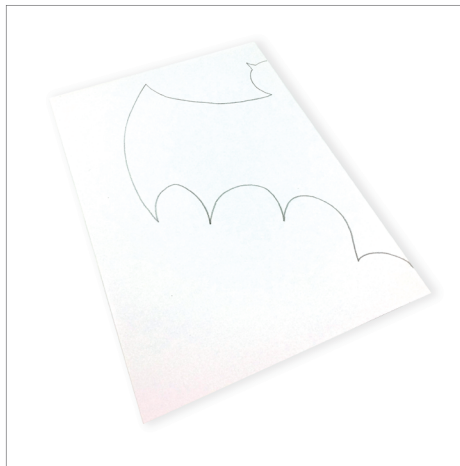
First, fold the white paper in half and draw half of a bat along the crease.